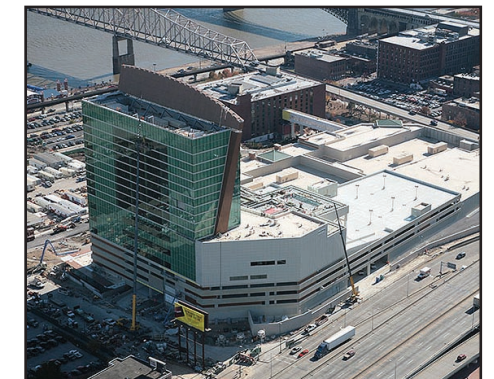
Lumiere Place Casino and Hotel

The glow of the more than one million LED's that form the crown of the sign marking Lumiere Place Casino and Hotel only scratch the surface of PayneCrest's involvement with the new beacon-like downtown St. Louis landmark. When awarded, Lumiere Place was the largest electrical contract ever let locally and at its peak employed more than 250 union electricians who tallied more than 400,000 man hours over 18 months. It required PayneCrest to install electrical, fire alarm, voice data, audio-visual and security systems in a 294-room Four Seasons hotel, a five-story parking garage, saltwater outdoor pool, multiple fountains, a casino atop a 70,000-square-foot floating barge, five restaurants and three bars. PayneCrest also met the challenge posed by more than 500 change orders – aided in large part by its on-site 1,300-square-foot Computer Aided Drafting (CAD) operations center.