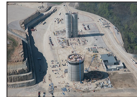
Holcim Cement Plant