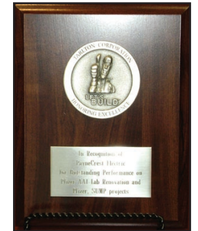
Tarlton Performance Award

Additionally, PayneCrest was recently honored by Tarlton Corp. for "Outstanding Performance" on the Pfizer AA1 Lab Renovation and Pfizer, SUMP projects.