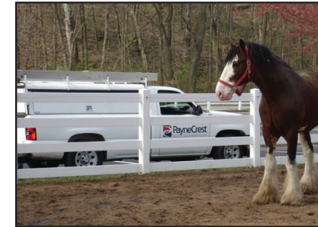
A Clydesdale enjoys enhanced security.