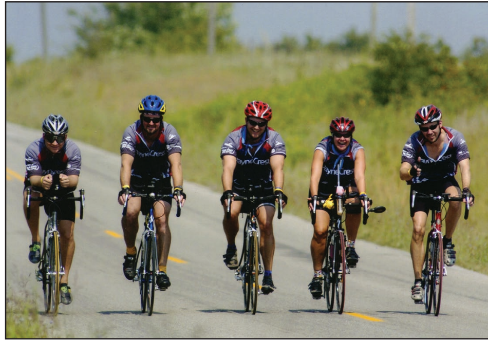
Team PayneCrest rides with enthusiasm – even on the hills!

To learn more or to register, contact Shelnett before June 1 at 314.996.0447 or tshelnett@paynecrest.com.